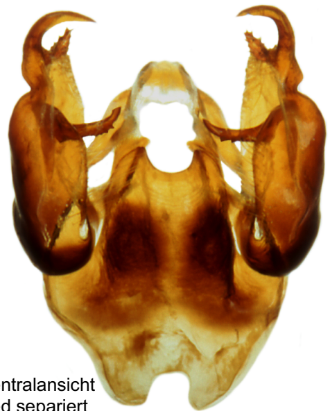
Ventralansicht Aed separiert