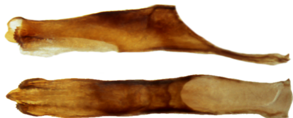
Aedoeagus lateral oben gedreht bis dorsal unten