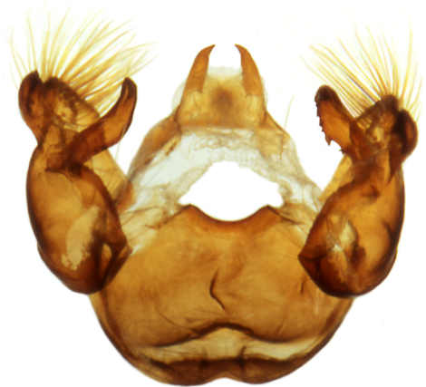
Kaudal-Ventralansicht Aedoeagus separiert