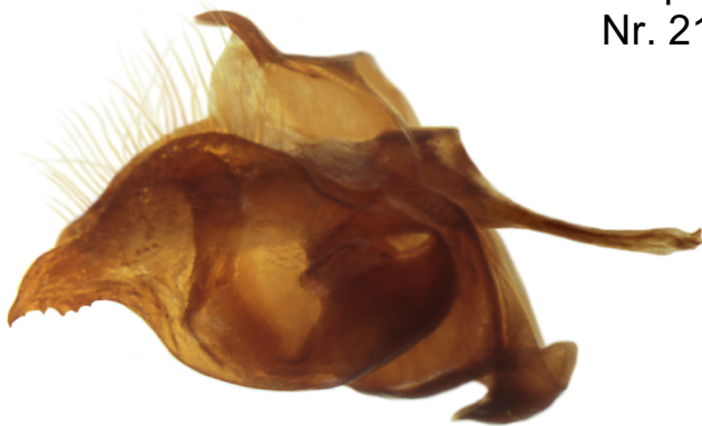
Lateralansicht anatomisch rechts